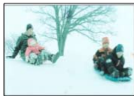
Sledding at Crystal Lake Park