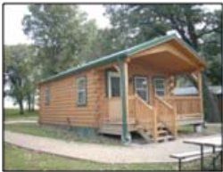
Crystal Lake Park Rental Log Cabins