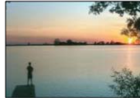
Sunset at West Twin Lake